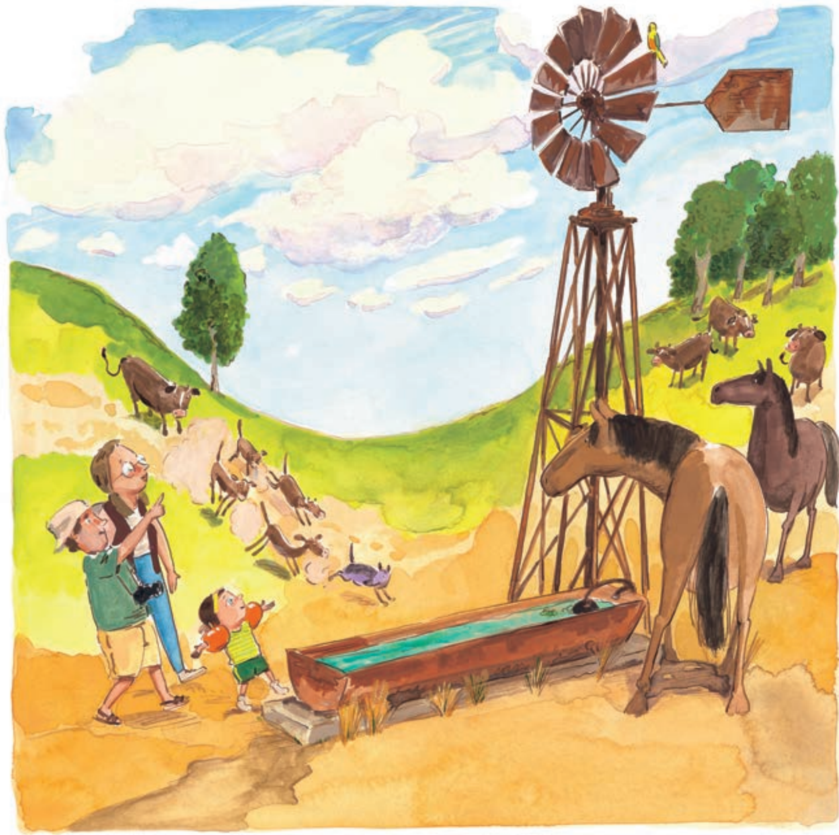
One day her parents took her to visit a farm.