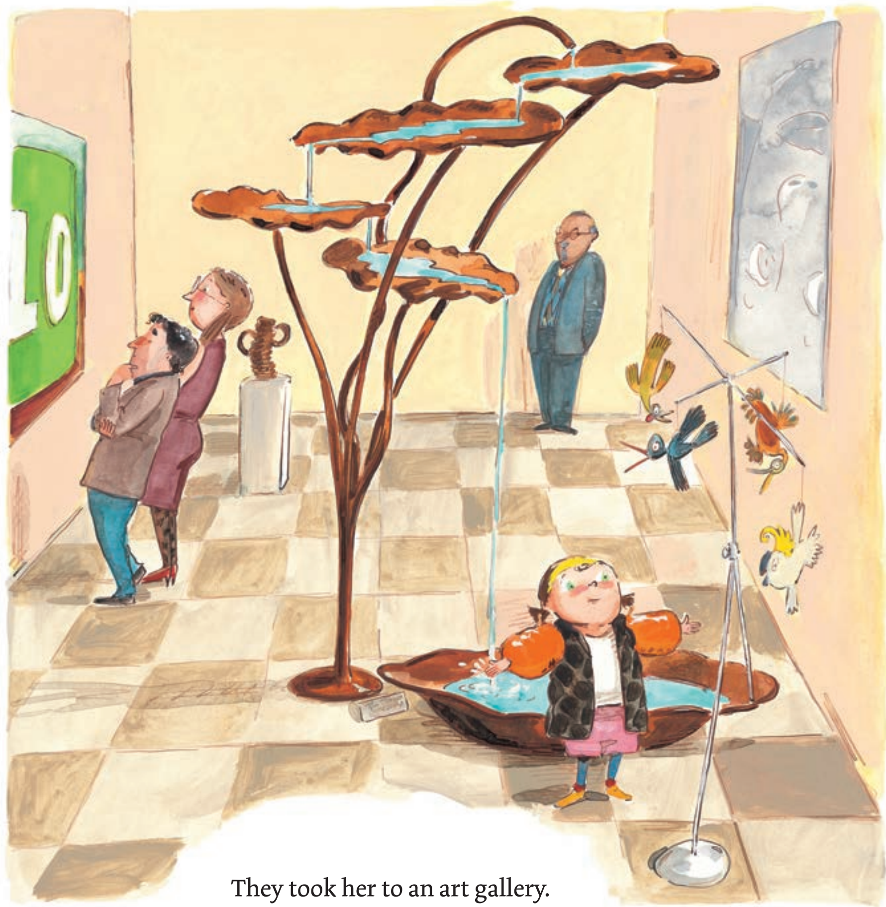
They took her to an art gallery.