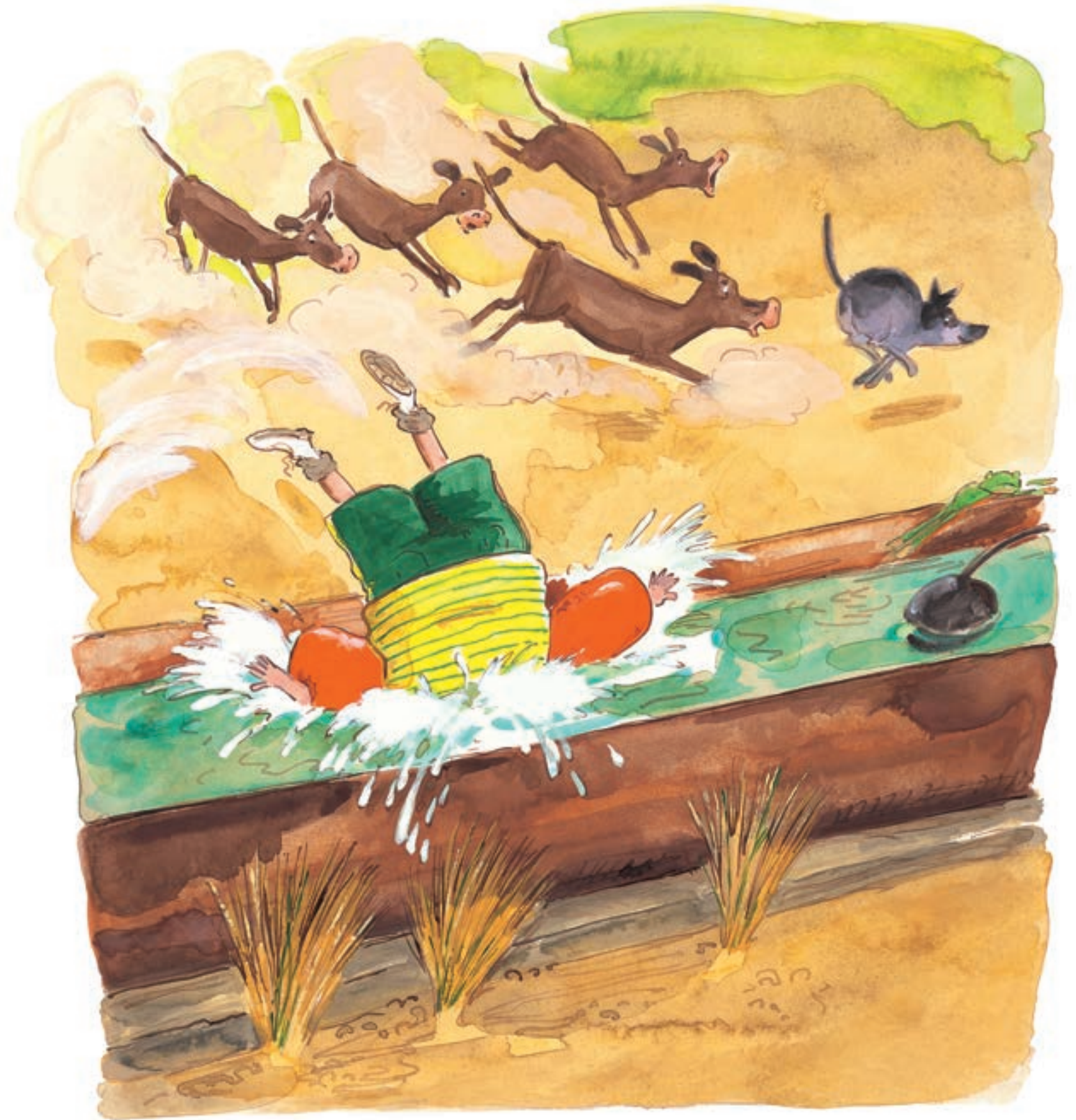
Heather fell in the water.